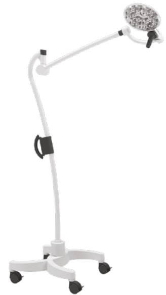
Mobile with 2 antistatic castors